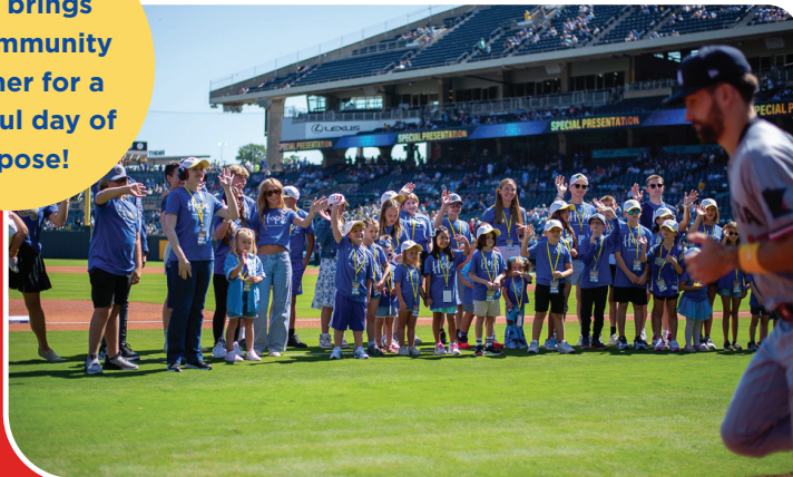
CHILDHOOD CANCER AWARENESS DAY AT THE K

Our Day at the K brings our community together for a powerful day of purpose!