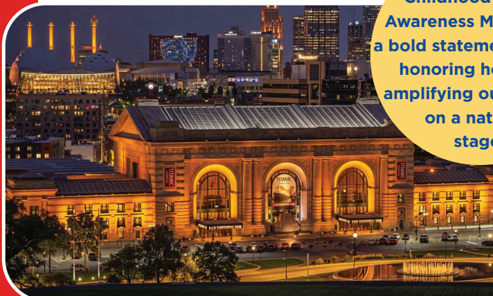
GO GOLD KC

Closing Childhood Cancer Awareness Month with a bold statement in gold, honoring hope and amplifying our mission on a national stage.